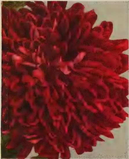
SUCCESS. $1.00 each; 3 for $2.50

6 Supreme MUMS All high-quality varieties. The blue-ribbon winners. 6 Sure-to-Bloom Plants $3.50 (1 of each pictured)